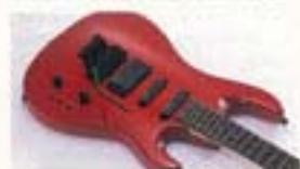
Carved Top, CT-CT3

The carved top of the CT-CT3, and CT-CT2 guitars were designed with overall playability and looks in mind. In producing this design, Aria has taken into consideration the musician's tactile and visual needs.