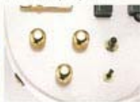
PRB-60 Active Control PRB-60

The PRB-60 Active control is designed specifically for high impedance passive pickups and offers a wide range of tones by boosting the high and mid frequencies through a front and rear pickup mix.