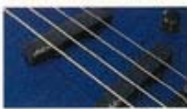
Bridge Saddles (LBB-CST)

nics create a very warm and powerful sound with very little noise.