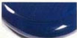
Body Construction (LBB-CST)

As the Libra guitar, the Libra bass is also multi-laminated. The superior acoustic response as well as its beautiful wooden grain are joined to make this bass a unique combination.