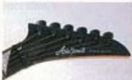
14" Pitched Headstock (SR-11)

The 14" pitched headstock on the XR series offers several advantages. The strings are more securely tensioned over the nut, resulting in fewer string buzz problems on the bass strings. The string action at the nut can be adjusted lower with his design than with conventional designs. When a lock-nut is used, there is far better stability throughout, and lower register chord or single note playing is greatly improved.