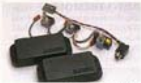
Model: 2AXY/AE-1 © 1987 LTD

The SB-LTD comes with the ALEM-BIC 2AXY/AE-1 pickup, the choice of many fine professional musicians. The SB-1200 is fitted with the AP-3 and the AJ-3 active pickups. The ELT has two MB-V dual coil pickups. These pickups provide a low noise, high output state of the art sound.