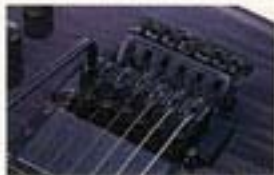
LIBRA (4) (01202)