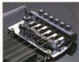
SL-DX-3 Tremolo CE-K102

This rugged fine tuning tremolo system with string locking nut is standard equipment on SL-DX-3 model. Dive with the best and still come back in tune.