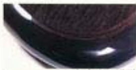
LIBRA (1) (01202)

The multi-laminated body of the Libra series combines the advantages of light weight, resonance, and beautiful wood grain.