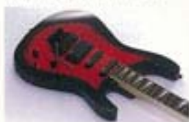
XR Series (SR-11)

The XR series body was designed to meet the demands of musicians wanting maximum performance and output from a smaller and lighter guitar, yet retaining excellent balance.