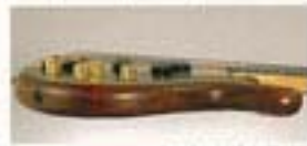
Model: Super Balanced Body © 1987 LTD

The SB-LTD and SB-1200 are made from one piece of high-grade stained ash. The beautiful and sleek tapered construction - 48mm at the bottom edge-give these instruments a superbly balanced feel with great sustain. One piece of ash is also used for the body of the SB-ELT. It's 43mm wide construction combines balance and beauty with superior performance.