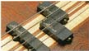
Model: MB-V © 1987 LTD