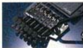
TRS-101 Tremolo (SR-11)

tion problems have been eliminated, allowing the player to "Dive Bomb" with confidence.