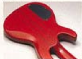
Neck Through Body (IGB-65)

As featured previously only in the SB 1000 Super Bass, Aria Pro II now offers their unique through neck body neck joint in the IGB-65, Aria Pro II Through Neck is 5 piece lamination of maple/walnut fused through the body to provide effortless access to the highest fret.