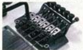
TRS-101 Tremolo, CT-CT3

The ACT-2X Tremolo unit is a simple, reliable design that affords smooth, easy arm movement with