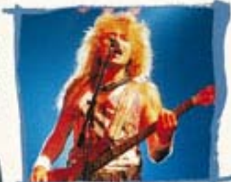
Rudy Sarzo (WHITE SNAKE)