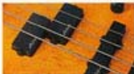
Pickup Selector Switch (LBB-CST)