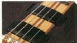
Model: AP-3/AJ-3 © 1987 LTD