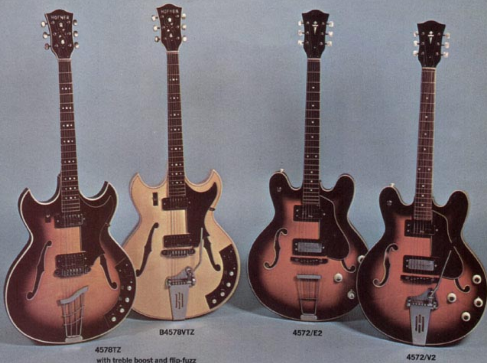
4578TZ with treble boost and flip-fuzz