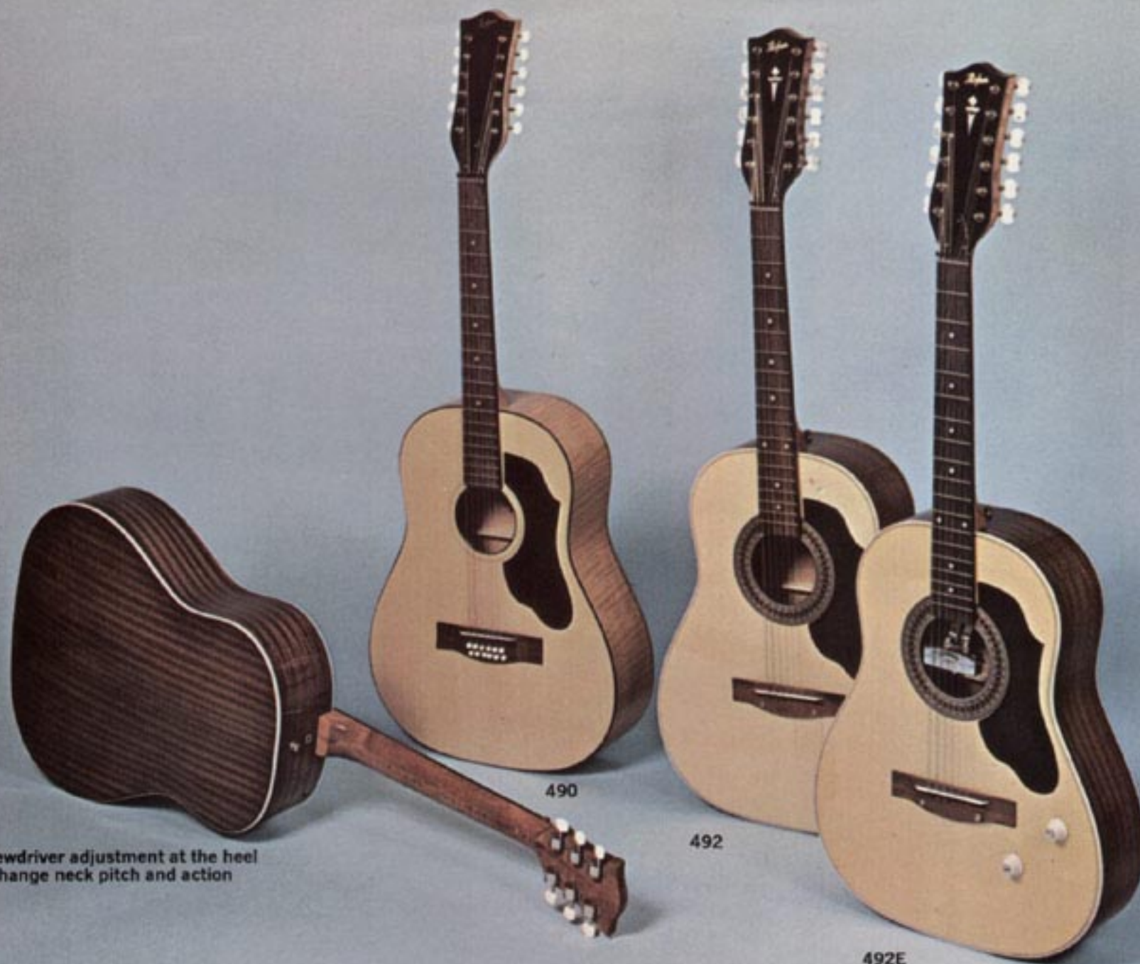
Screwdriver adjustment at the heel to change neck pitch and action