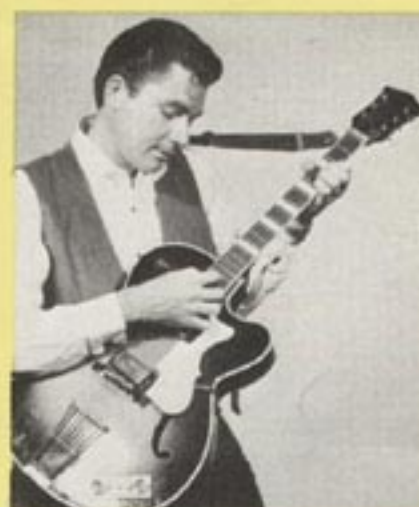
LOU DEWITT— THE STATLER BROTHERS