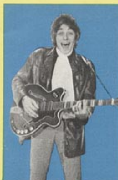
KEITH—THE WILD KINGDOM