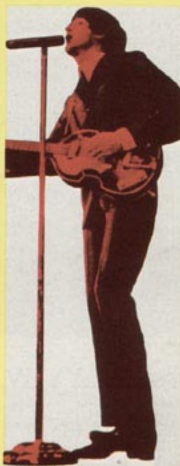
PAUL McCARTNEY— THE BEATLES