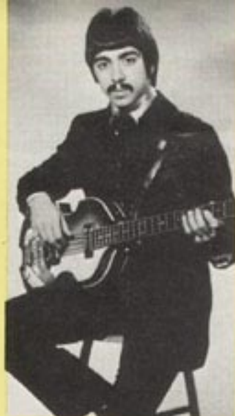
TONY FORTUNA— THE BUCKINGHAMS

THE CHOICE OF LEADING ARTISTS AND GROUPS