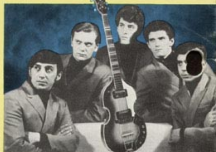
TOMMY JAMES AND THE SHONDELLS

EXCLUSIVE AMERICAN DISTRIBUTORS SORKIN MUSIC COMPANY INC. HAUPPAUGE, L.I., N.Y. 11787