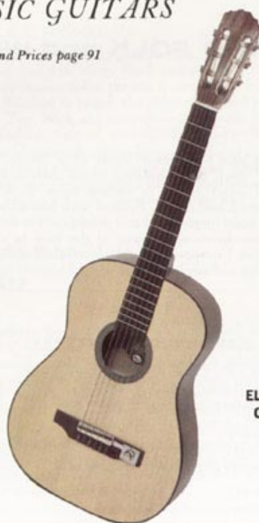
E484 ELECTRIC CLASSIC