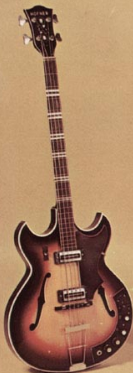
500/8BZ with fuzz and bass boost