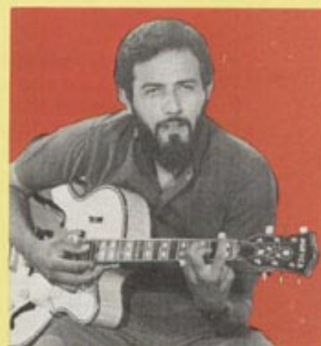
SAM THE SHAM