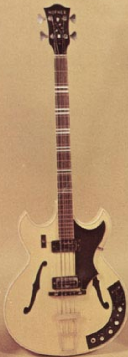
B500/8BZ with fuzz and bass boost