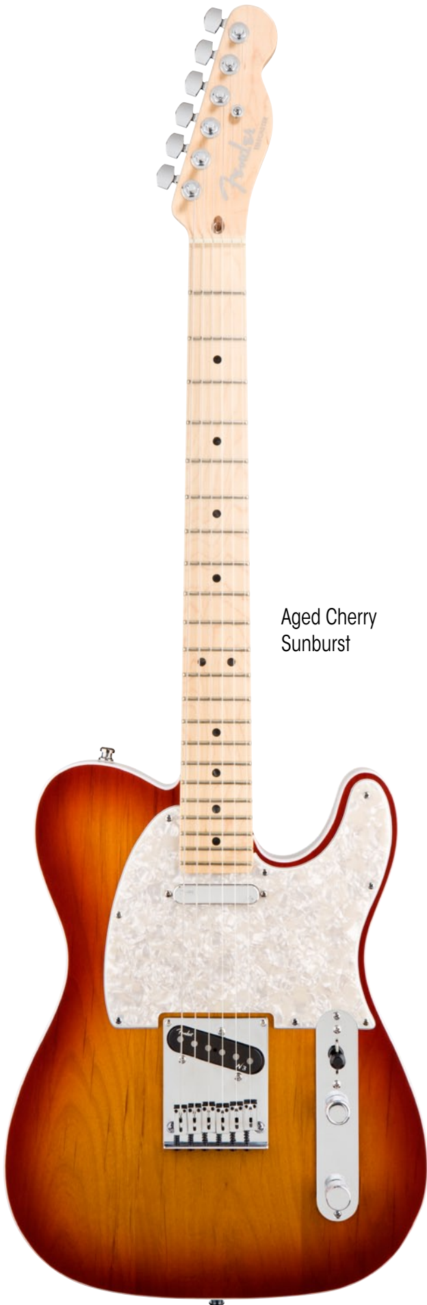
Aged Cherry Sunburst